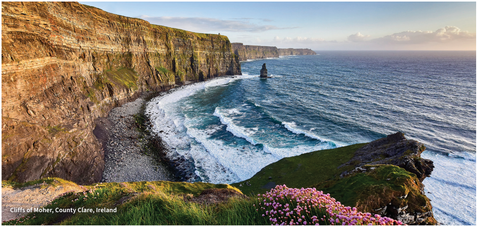
Cliffs of Moher, County Clare, Ireland