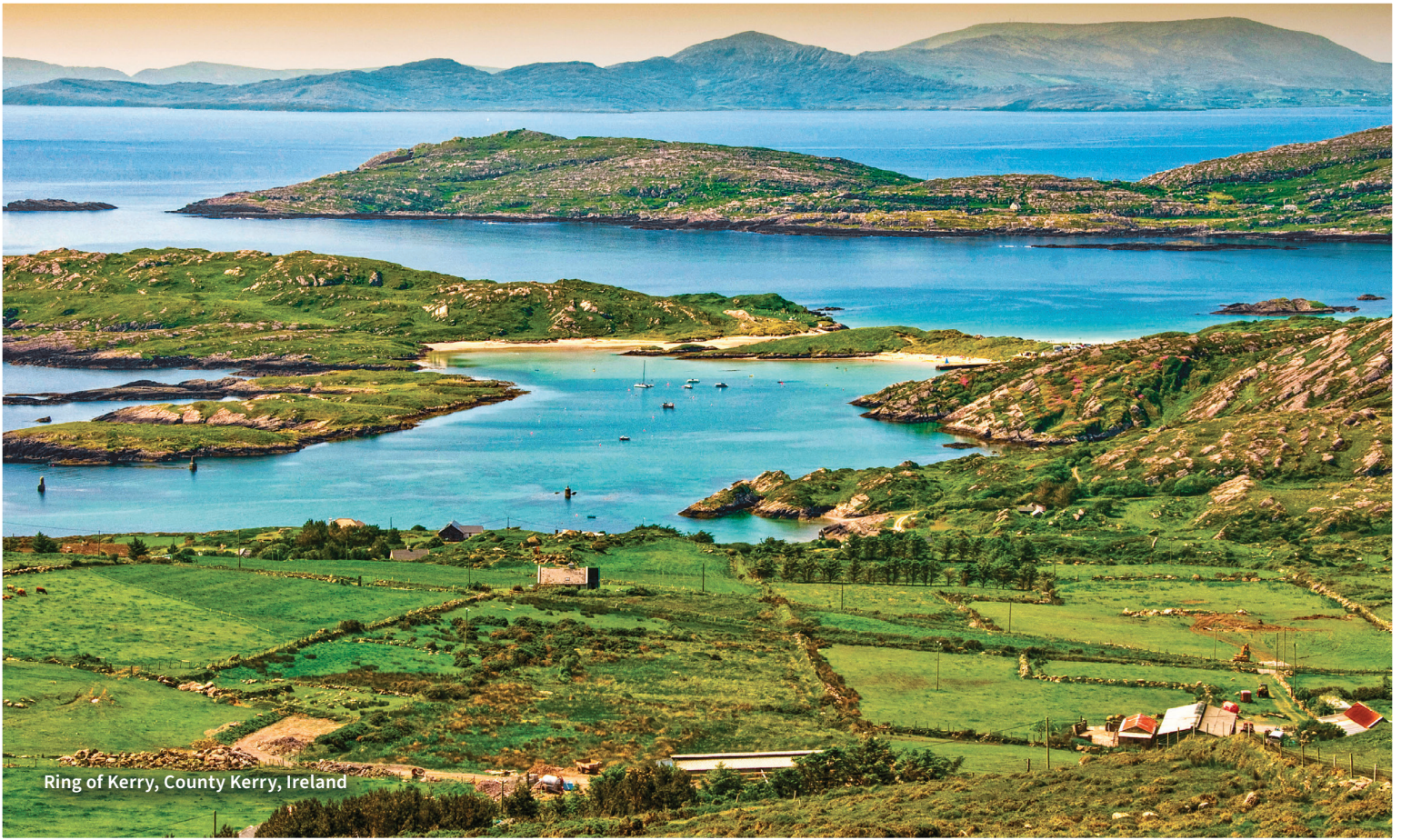
Ring of Kerry, County Kerry, Ireland